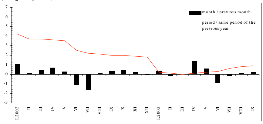
Chart 1 Costs of living (changes in percent)