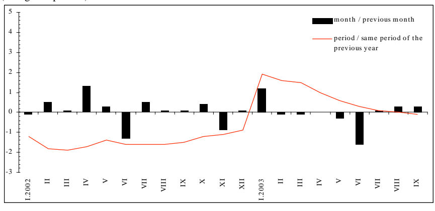
Chart 3 Prices of producers of industrial products (changes in percent)

...while they decreased by 0.1% on a cumulative basis